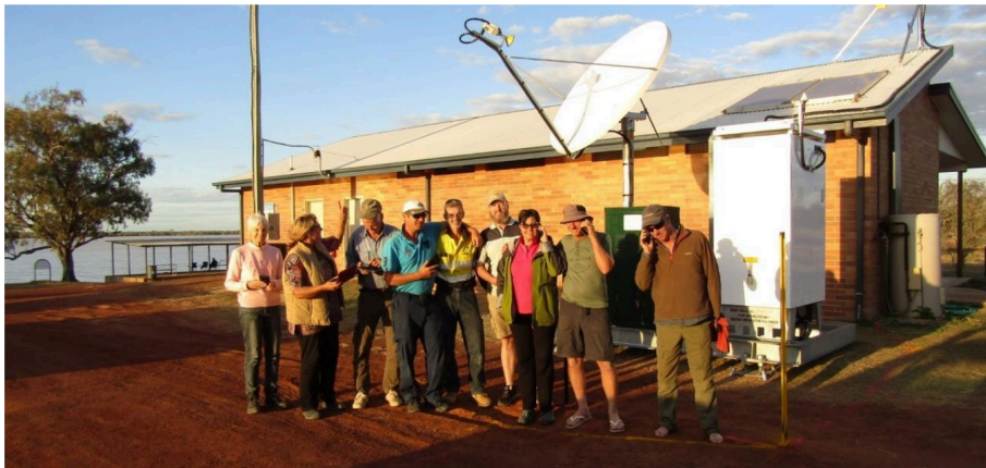
The Telstra 4G Mobile Satellite Small Cell tower being used by tourists at Lake Dunn.

A Telstra 4G Mobile Satellite Small Cell tower was commissioned and installed at Lake Dunn last week. This will enable mobile phone, messaging and emailing use in the area surrounding the toilet and shower block. The station has a guaranteed reception radius of 500m but may be picked up from three (3) kilometres away. This is a great asset to the Lake Dunn area for locals and tourists and their safety and connectivity.