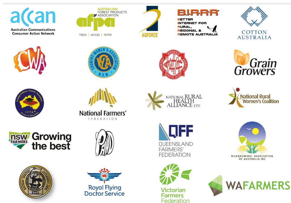
RRRCC Member Organisations

Organisations such as BIRRR, ICPA (Aust), Country Women's Association and other groups who formulate the Rural, Regional and Remote Communications Coalition (RRRCC) should be consulted in regards to prioritising the investment and how this can be best achieved. Additionally, specific areas may already have stakeholder groups and organisations in place that can assist in providing further information, such as Remote Area Planning and Development Board (RAPAD) in Central Western Queensland, Central Highlands Regional Resources Use Planning Cooperative Limited (CHRRUP) in Central Queensland, Western Australia 'Grower Groups' and other place-based support groups and organisations. Those 'on the ground' in regional areas are well placed to identify local telecommunication priorities.