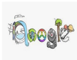
Doodle contest for kids reveals ... cnet.com