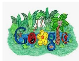
Google's Annual Doodle Contest Is Now Open news.artnet.com