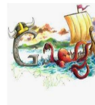
Google doodle contest ... pinterest.com