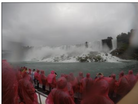
Above: Niagara Falls.