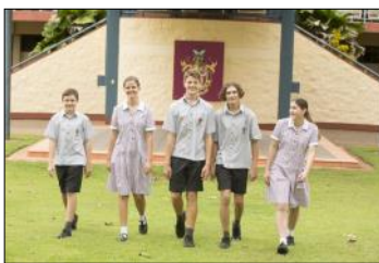
Haileybury Rendall School Darwin www.haileyburyrendall.com.au

"HRS boarding offers many wonderful opportunities to the young people of northern Australia. Our boarding staff are caring and experienced; they go above and beyond to ensure that all students are supported."