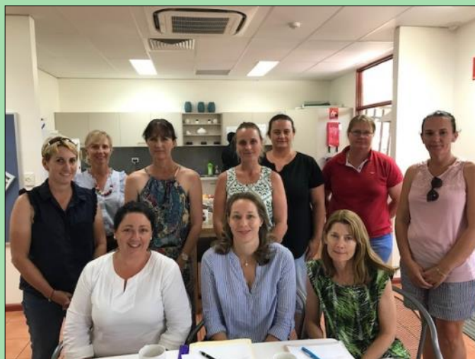
Above Photo of the 2019 Committee

On a lighter note, I wish everyone a fantastic wet and muddy Christmas and New Year. Good luck to all our kids transitioning into their new school years, and possibly new schools. The great thing about ICPA is that it doesn't matter what school, where you live, what your lifestyle is, you're still part of the ICPA family. Happy and Safe Holidays!