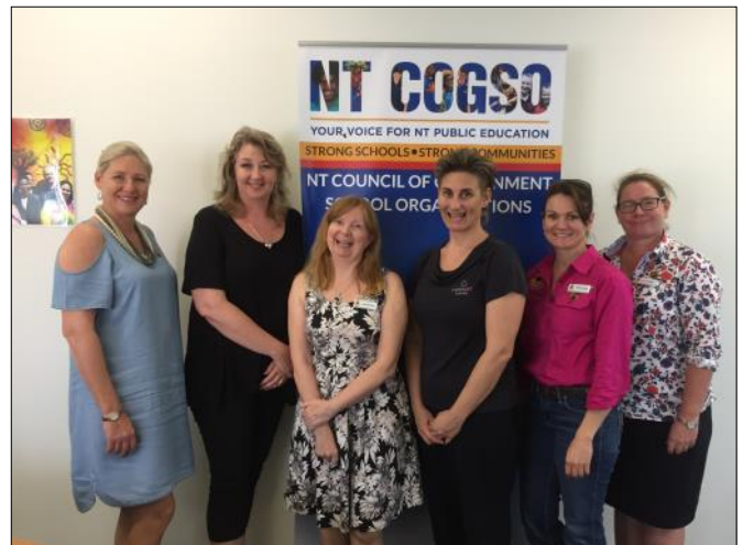
Delegation usually includes a visit with the fabulous team from COGSO (above) - who are very supportive of our organisation and our causes.

State Conference for 2019 will be held in Katherine. Please consider how you can assist State Council. You might consider becoming a Councillor (no experience required) or you might consider supporting State Council through your branch. Either way, together WE are working together for equity of access to education for all students who live in rural and remote Australia. Our effort is worthy. #ICPA.