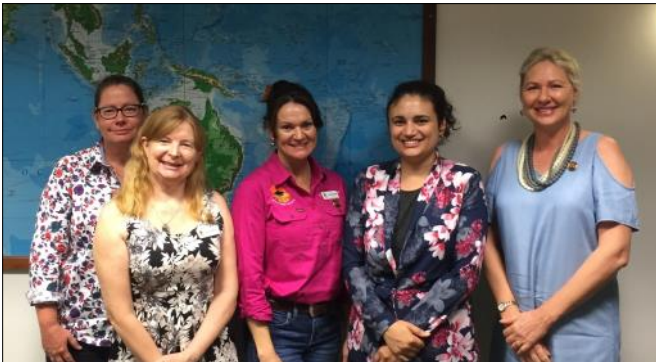
Our hard working girls above, with Minister Lauren Moss.

Distance education: The Chief Executive, Department of Education advised NT ICPA that all Northern Territory Schools have been given a budget for replacing equipment, using a rolling replacement schedule. This addresses the motion to ensure that all Northern Territory schools delivering distance education receive adequate funding to supply an appropriate computer/laptop for each child for the duration of their schooling when enrolled in distance education.