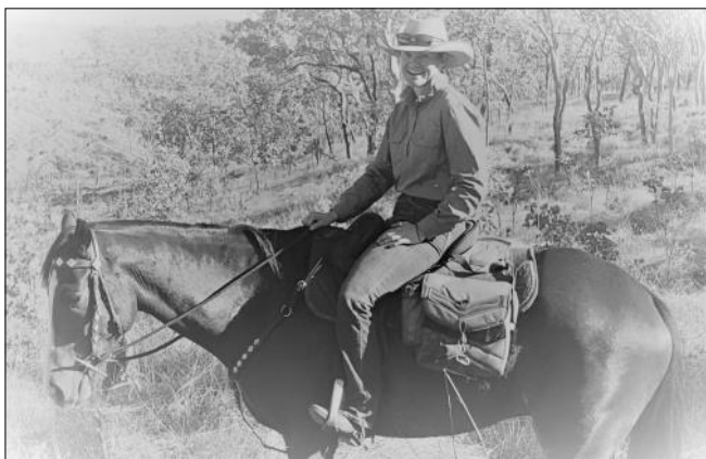
Front Cover: NT members at Federal Conference in Canberra in August.