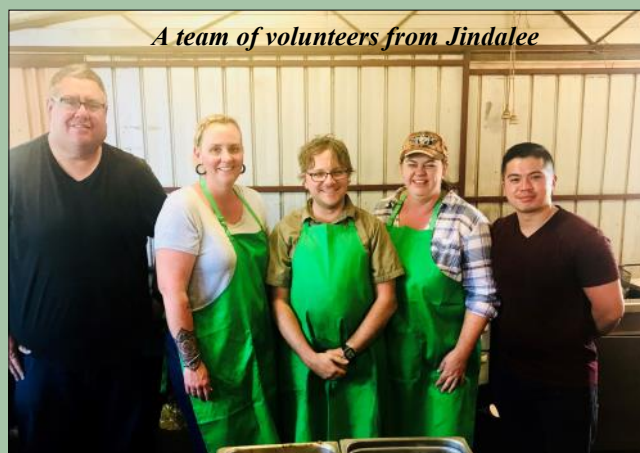
A team of volunteers from Jindalee