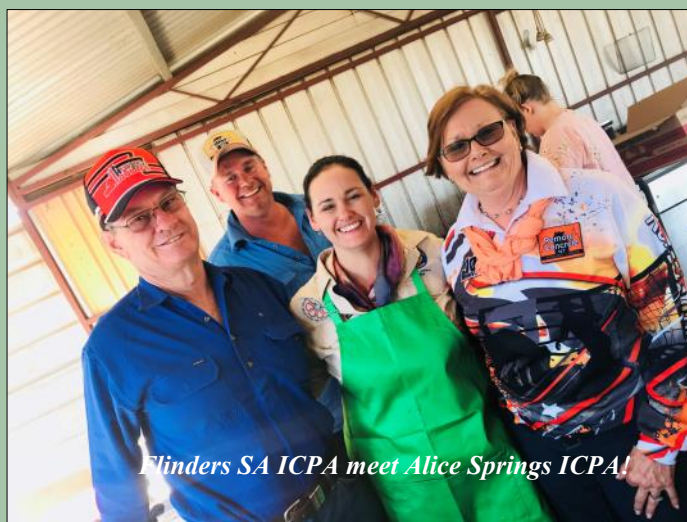
Flinders SA ICPA meet Alice Springs ICPA!

Over the weekend we ran out of sauce! Yes that's right! – no Tomato or BBQ sauce to be found in the ICPA Canteen at all! The sauce SOS was broadcast over the loud speaker at the rodeo grounds for Harts Range race & rodeo goers to donate their sauce bottles to the ICPA canteen. And that they did. Such a simple gesture of support - many people in the crowd did not hesitate to offer their sauce supplies so our Canteen could offer everyone a steak sandwich or a hotdog with sauce.