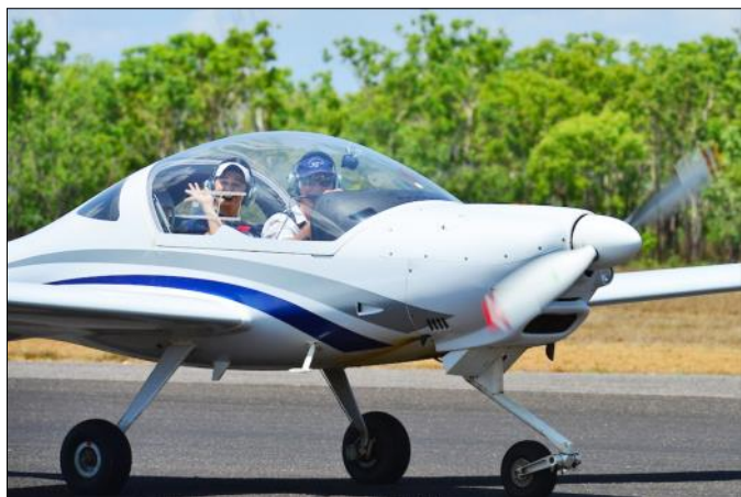
This year the school celebrated the eighteenth year of its year 10 'Learn to Fly' program.