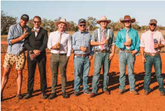
Fashions on the Field for the men

The Derby Bullarama and Kimberley Picnic Races on 7 th and 8 th August were the first public events for the Kimberley since prior to COVID restrictions. They will be two of only a few events the region will see this year. Organisers worked extremely hard to get the two events up and running in a short amount of time. Being the first events no one really new how they would go but were pretty sure it would be bigger than usual. And so they were! There were record crowds of 1000+ patrons at both. A huge congratulations and thanks goes to all organisers and helpers who volunteered their time in planning and running of the massive weekend.