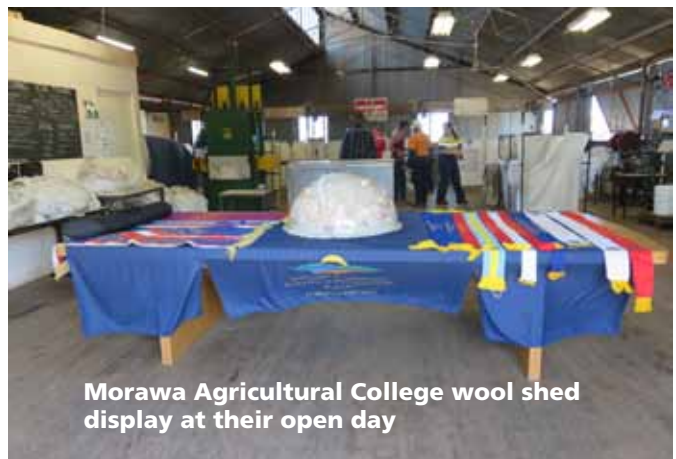
Morawa Agricultural College wool shed display at their open day