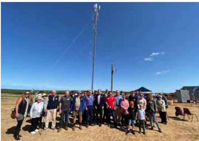
Goodlands Mobile Tower Launch