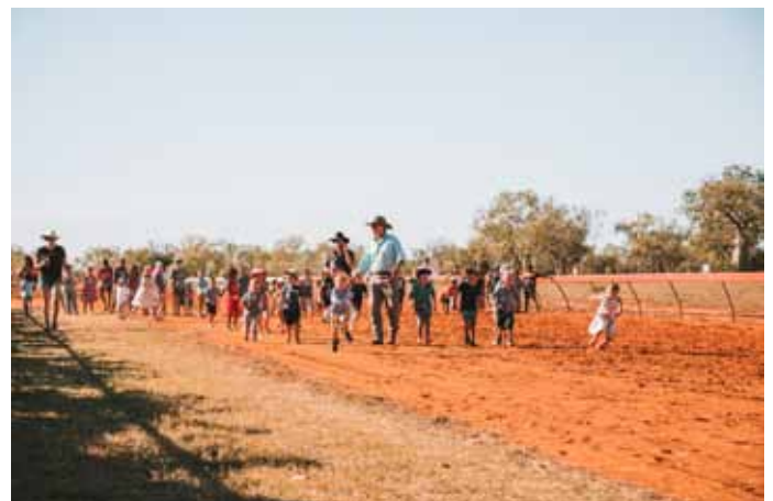
The children enjoying their foot race

The funds raised each year for the P&C assist the KSOTA students to be able to partake in extracurricular school activities, such as valuable school camps, where the students get to be with their classmates and have face-to-face class time with their teachers for a week - a highlight for all students. The P&C also assist in a number of other