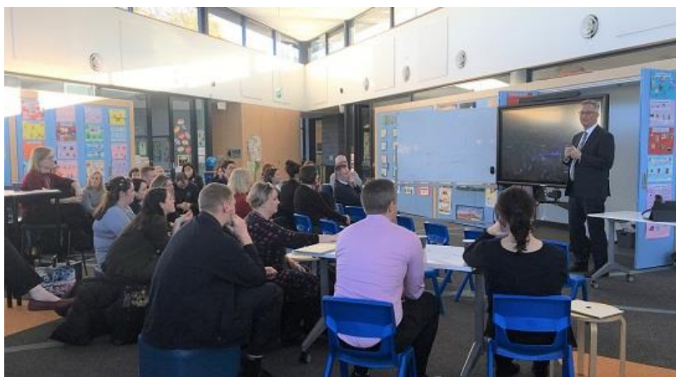
Radford College, ACT