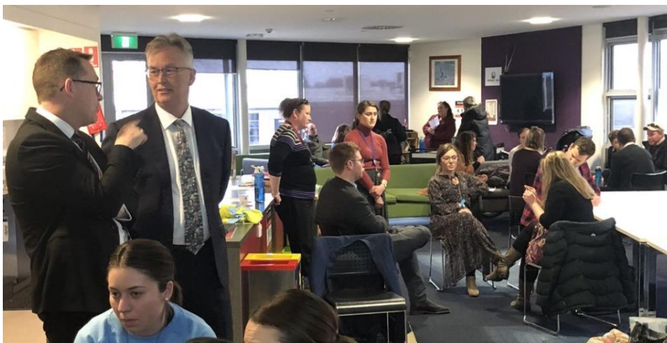
Holy Spirit Primary School, ACT

Visit the ACARA's website for more information on the review of the F–10 Australian Curriculum.