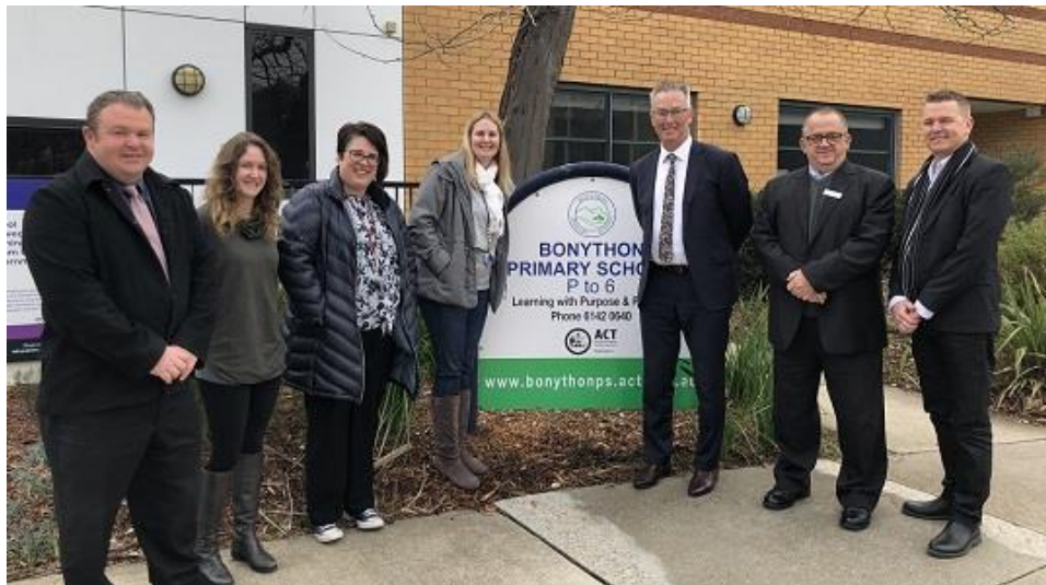
Bonython Primary School, ACT