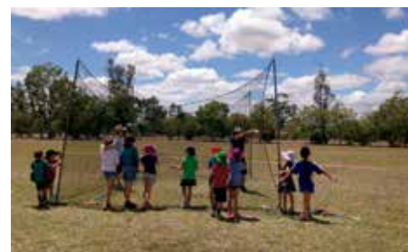
Coach demonstrating to the Kids