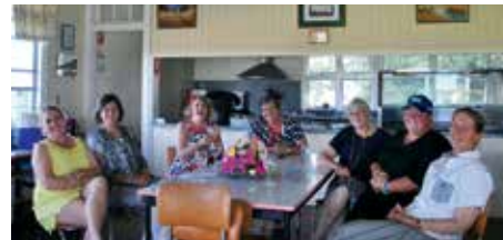
Time for bubbles – ABC ICPA members celebrating at great day.