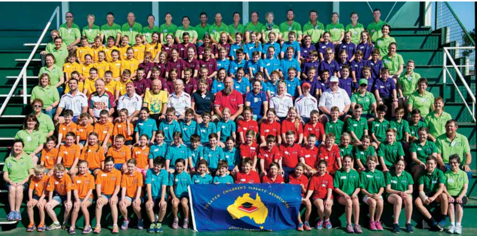
Clermont Sports Camp Young Athletes, Coaches and Volunteers

More than 110 children along with volunteers of 16 full-time carers, 14 caterers, 8 part-time carers, and an organising committee including a Camp leader, Camp coordinator, full-time nurse converged on Clermont for a week of team sports, ably coached by 10 national coaches. An incredible amount of time, effort and resources goes into making this camp a positive and inclusive experience. This is evident in the enthusiasm of the organisers and helpers, and the skills the children develop on and off the field.