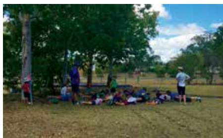
Planking Alpha Kid Style!