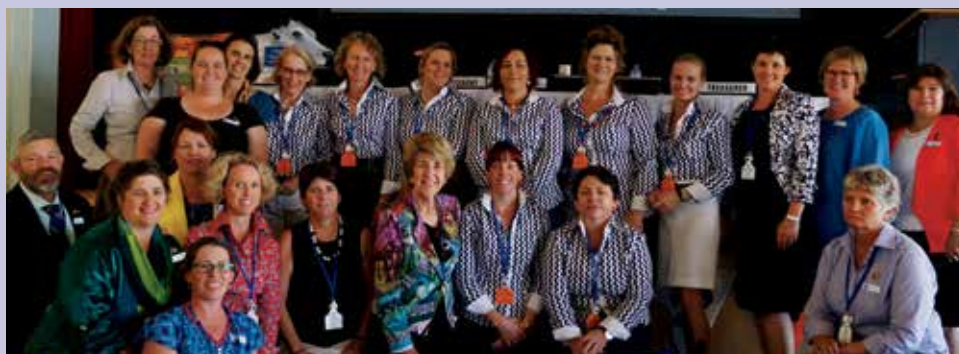
State Council & Conference Convenors