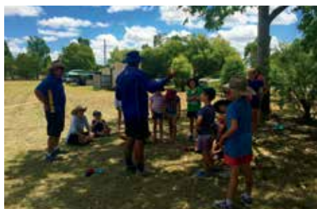
Coach speaking with the kids