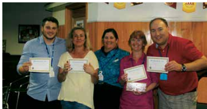
Pool Comp Winners