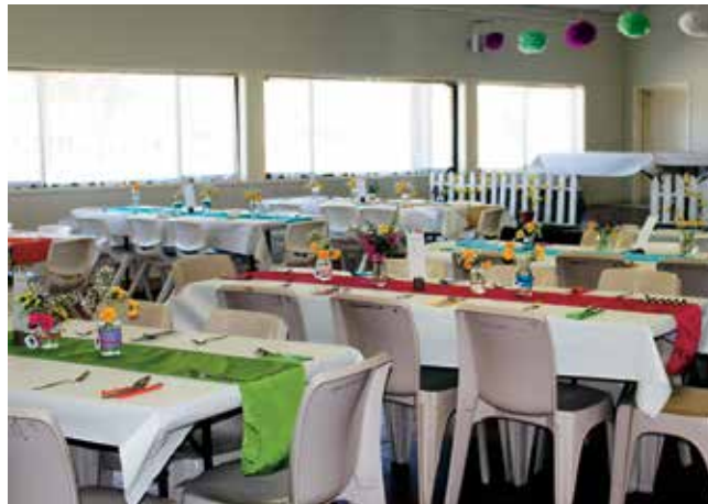
Melbourne Cup Luncheon in Style