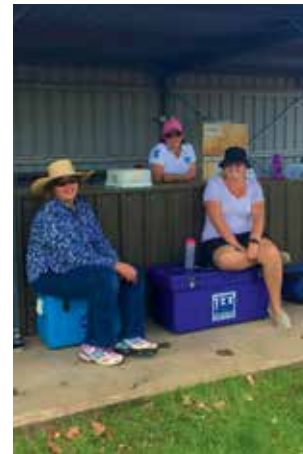
A well earned break