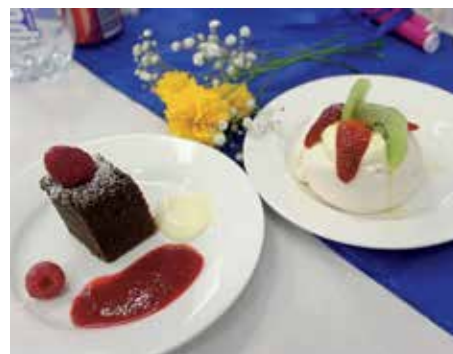
Desserts to be enjoyed indeed!