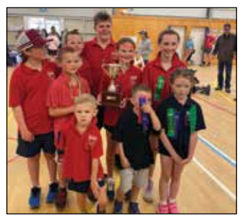
NW Branch kids at SOTA Sports