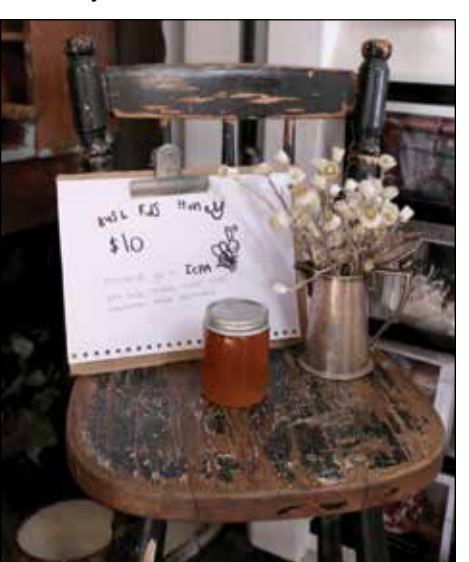
The kids' sign for honey sales.