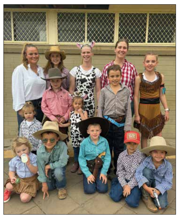
SOTA "Wild West" Themed Get Together Marla Oodnadatta Branch Kids & Govies.

Marla Oodnadatta Brach are looking forward to hosting the SA State conference "Making tracks on education" in Quorn on March 22nd, 2024. We look forward to seeing you all there.