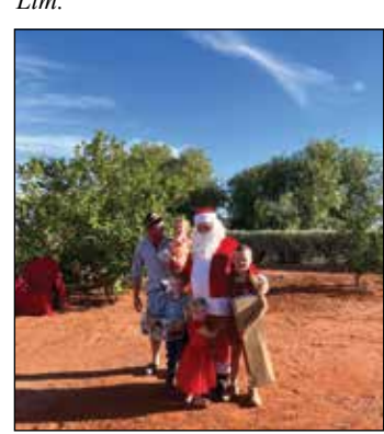
Santa stops by the NW Branch to check on who's been naughty and who's been nice.