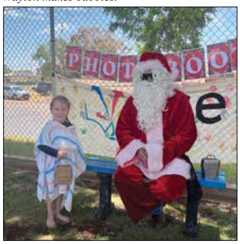
Memphis got a visit from Santa.