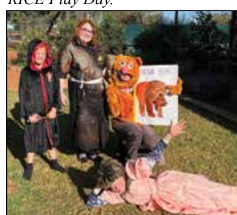
Book Week 2023.