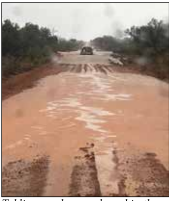
Takling a submerged road in the North West during rain.