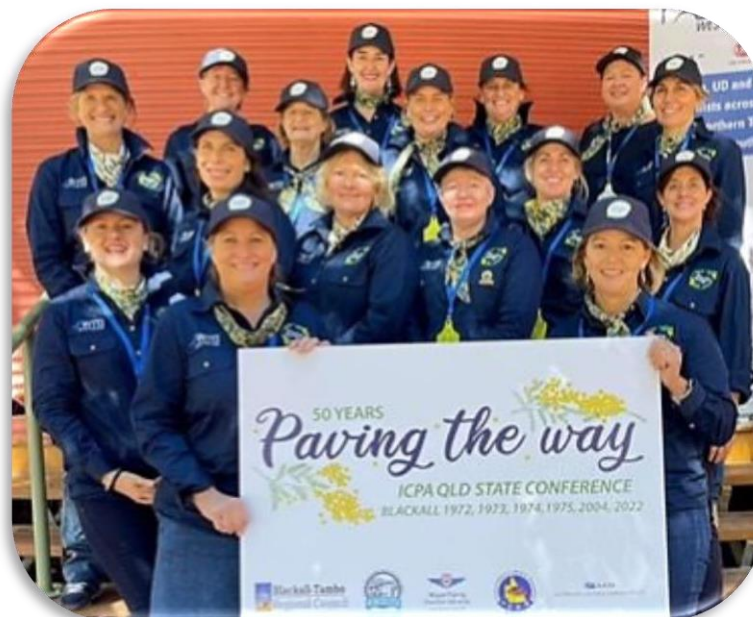
ICPA Qld State Conference Organising Committee and Branch helpers