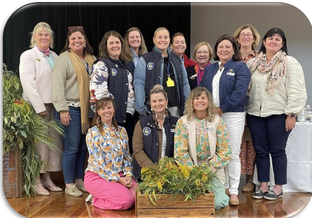
Newly elected State Council 2022 – 2023