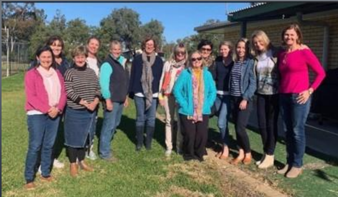
Roma Conference Convening Committee