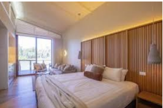
Euston Club Riverfront Resort – Cabins Euston Motel

Ph: 03 5026 4244 (also has RV Park) Ph: 03 5026 1133