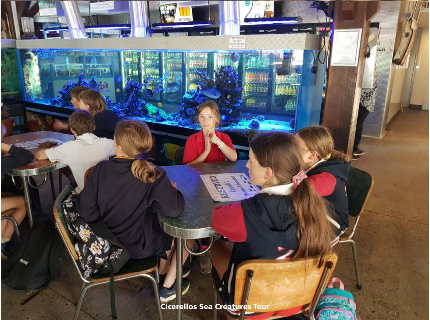
Cicerellos Sea Creatures Tour