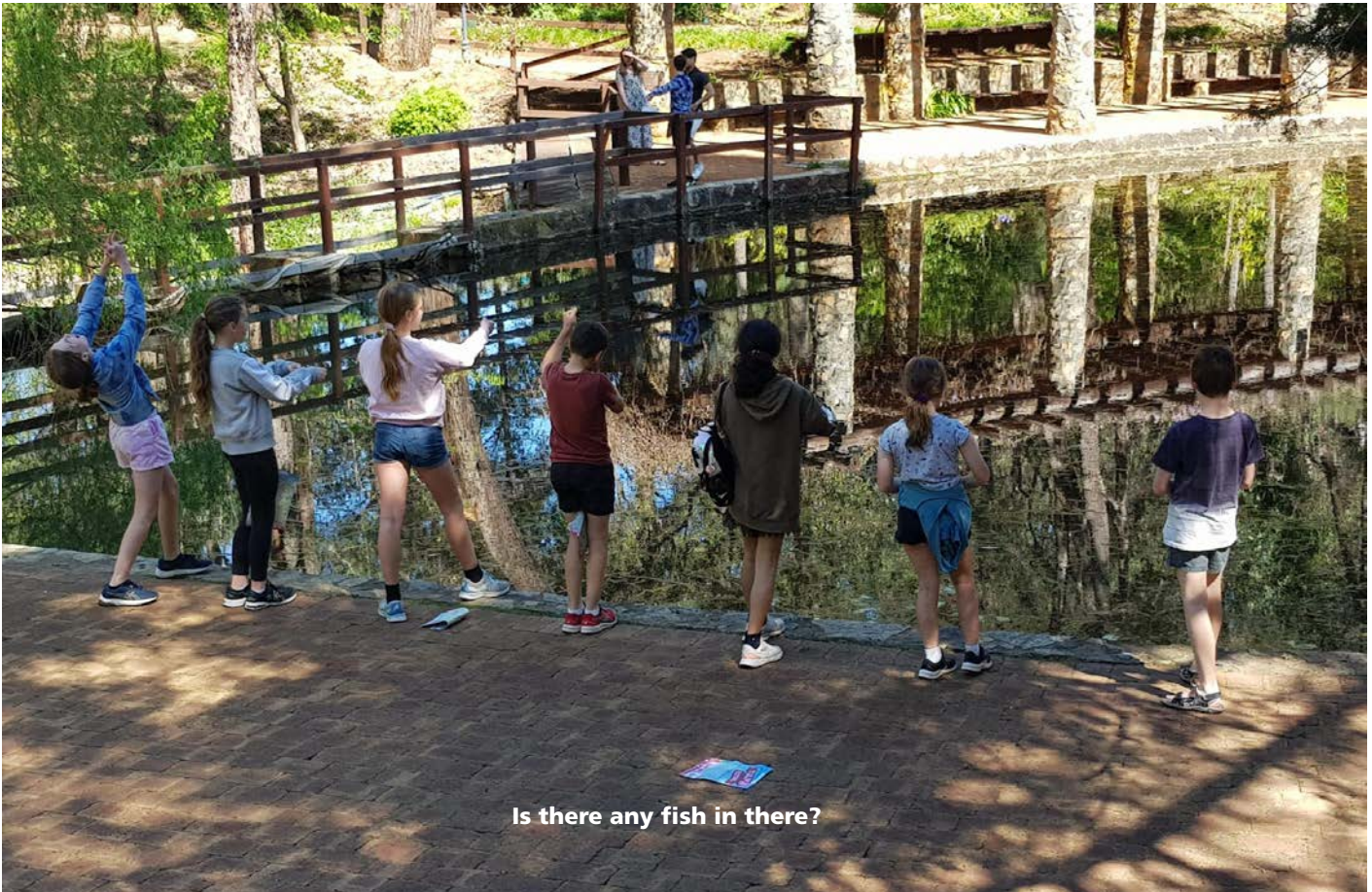
Is there any fish in there?