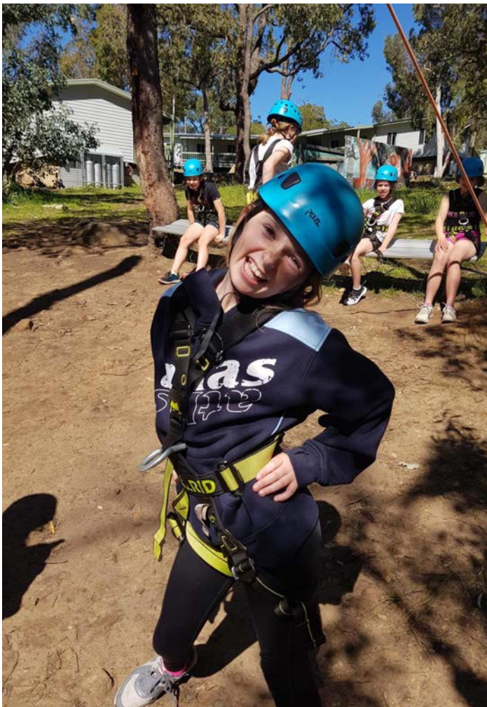
All ready for some zip lining