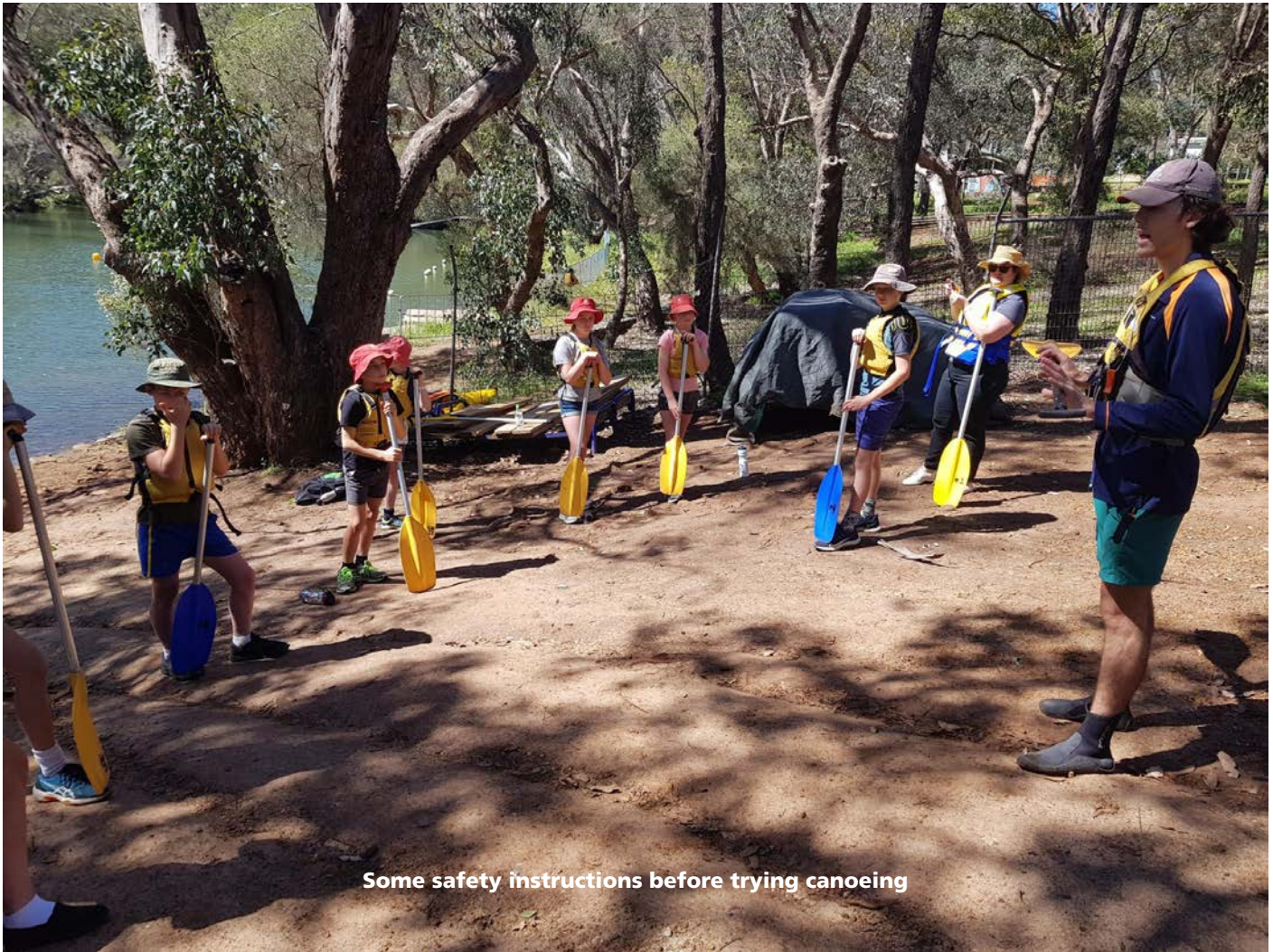
Some safety instructions before trying canoeing