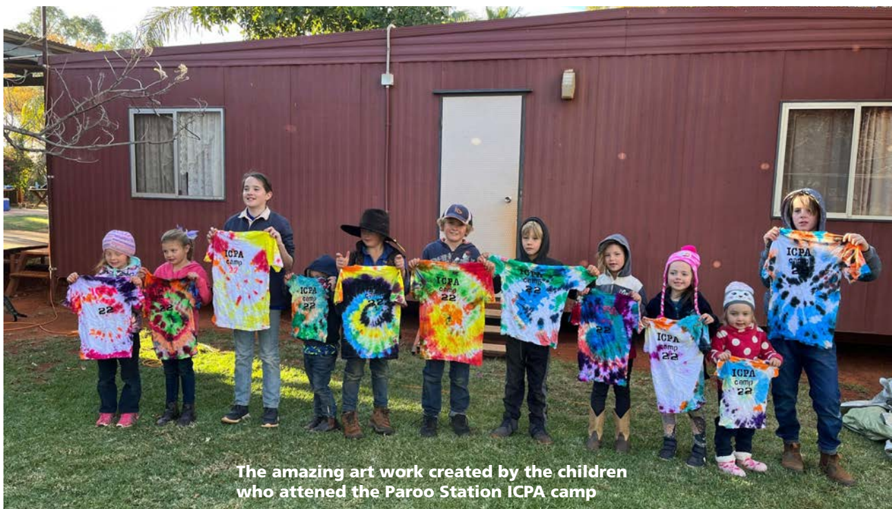
The amazing art work created by the children who attended the Paroo Station ICPA camp