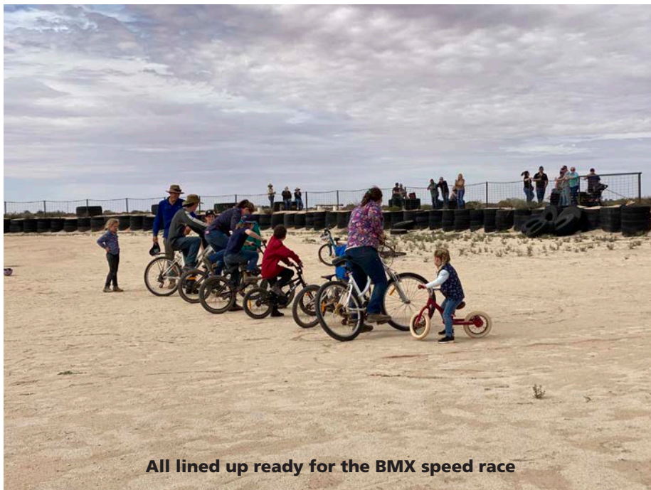
All lined up ready for the BMX speed race

While all the fun was happening with the kids on the flat, Amy Forrester was turning the Muster Club shed into a beautiful ballroom, our amazing secretary