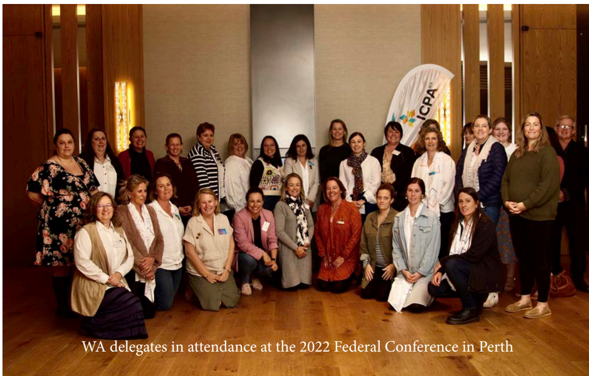
WA delegates in attendance at the 2022 Federal Conference in Perth