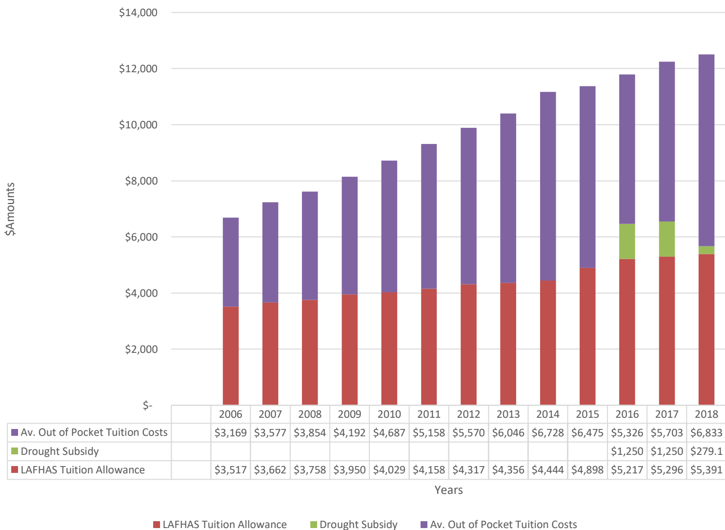
Average tuition costs - allowance & out of pocket costs 2006 -2018