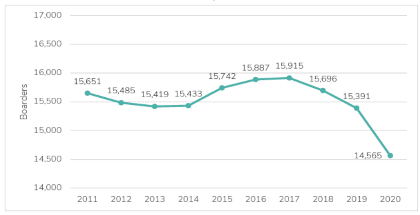
Chart 1 shows the number of boarders at Independent schools reducing between 2011 and 2013 before growing again to peak at 15,915 in 2017. Since 2017 boarder numbers have fallen to 14,565, a reduction of -6.9% since 2011.

It should be noted that between 2011 and 2019 the number of boarders only decreased by 260 (1.7%). The large fall in boarder numbers between 2019 and 2020 (-5.4%) accounts for most of the reduction in boarders between 2011 and 2020. The most likely reason for the reduction in boarder numbers, especially between 2019 and 2020, is COVID restrictions but the fall continues a downward trend seen since 2017.